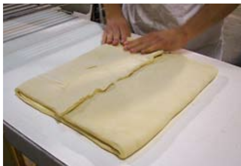
Place butter in the middle of the detrempe and fold dough to meet in the middle with a slight overlap.