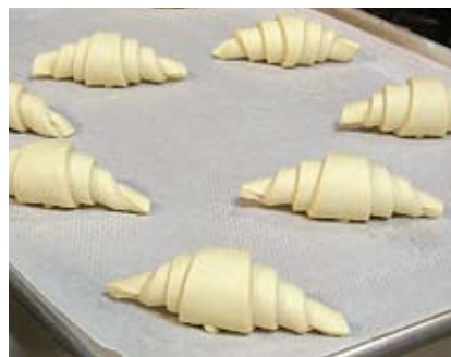
Lengthen each triangle slightly and roll up without applying too much pressure. Place the point under the finished piece.