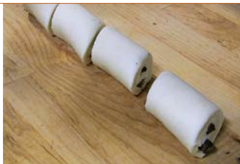
Fold edge over to cover the chocolate and place two more chocolate batons at folded edge. Roll up with edge underneath.