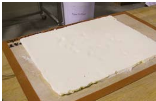
To make the 'butter block' pound until malleable and then run through the sheeter until about 8mm thick.