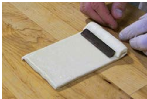
For pain au chocolat cut 7" x 3¼" rectangles and place one chocolate baton along the folded edge.