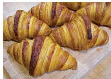
Bake at the appropriate temperature and time for your oven. A small amount of steam may be used if available.