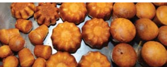
Clockwise from upper left: St. Joseph zeppole, struffoli, boboloni, baba au rum, sfogliatelle.