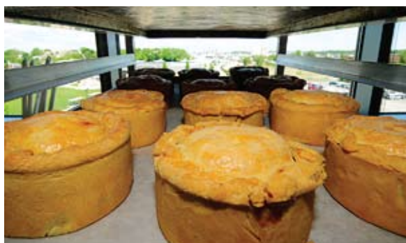
TOP LEFT: Assembling Pizza Rustica. TOP RIGHT: A slice of Pizza Rustica. BOTTOM: Pizza Rustica before slicing.