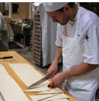
For croissant cut the dough into two 9½" wide strips and cut out triangles 4" wide at the base.