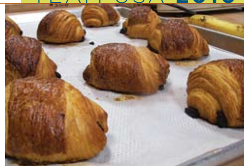
Finished pain au chocolat.