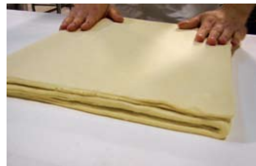
Begin sheeting the dough. The initial thickness will be 12-16mm with a final thickness of 3-4mm.