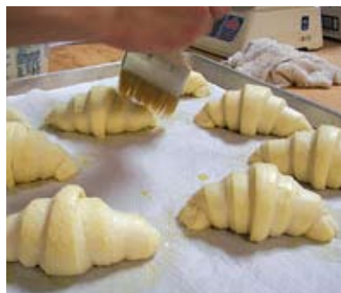
Prior to placing in the proofer, egg wash the croissant, then again after 45 min. Proof for 1½ and 2 hours.